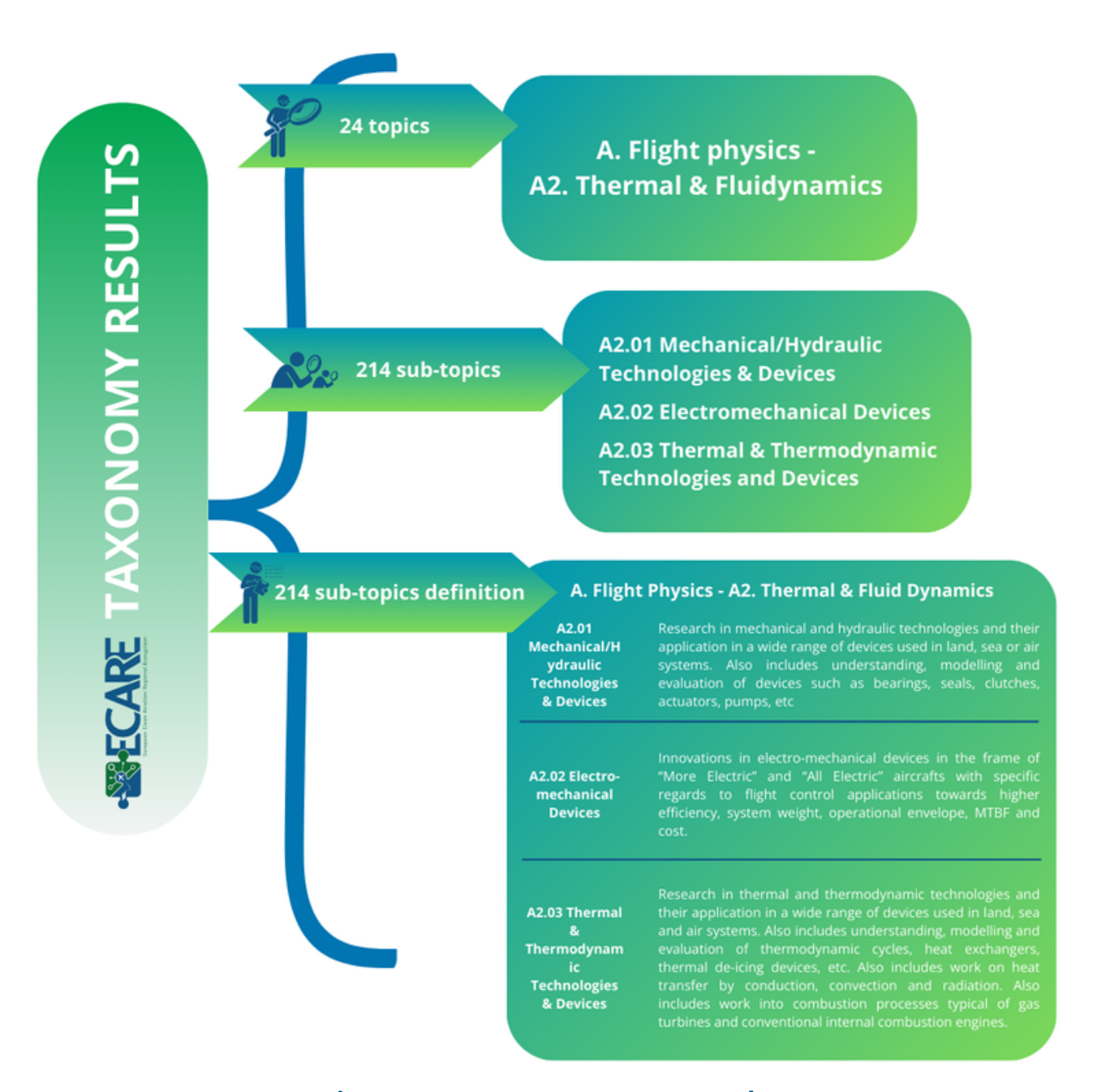
Figure 2: ECARE Taxonomy Results

The subtopics presented in Appendix 1 were defined by using and updating the definitions of the existing taxonomies. An example is presented in Figure 2 for the topic "A. Flight Physics - A2. Thermal & Fluid Dynamics" with the related subtopics and their definitions.